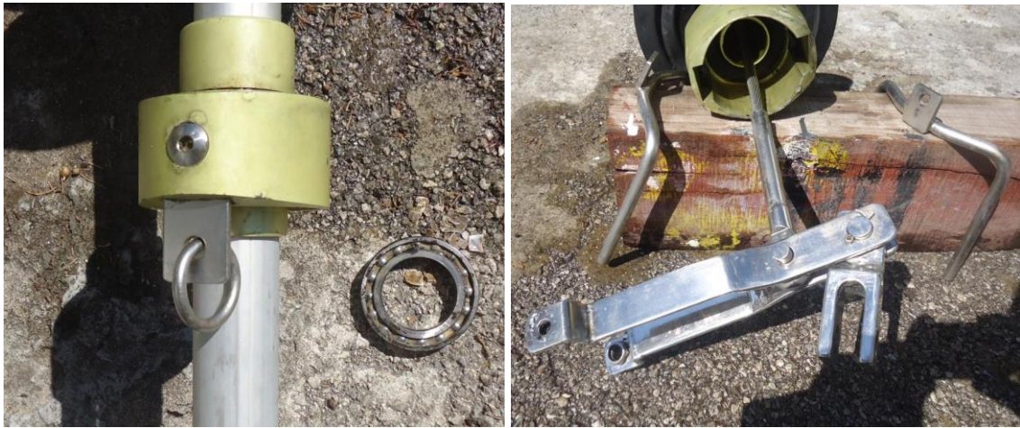
Halyard Swivel Bearing replaced with new seals Note: Lower swage and fittings