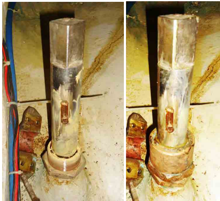
Servicing Rudder Gland