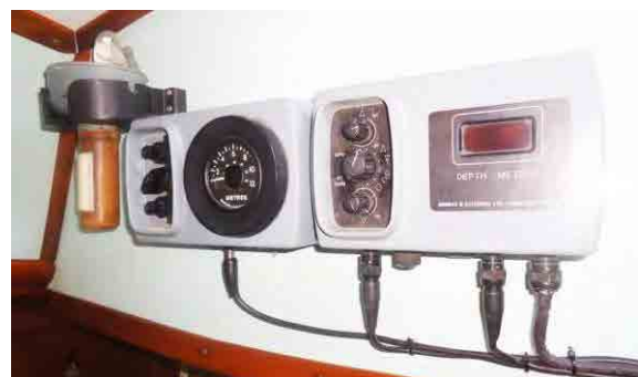
Part Domestic battery bank, selector switch, anchor winch breaker & 220V Battery Charger Kenwood Shortwave Radio – Standard VHF with handset – B & G Depthsounders