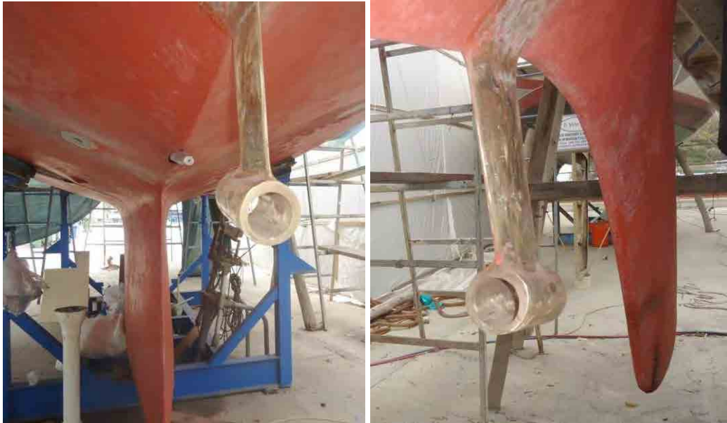
New Cutlass bearing was fitted