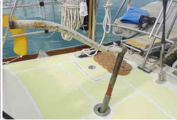
Aft deck views Note: Emergency Tiller