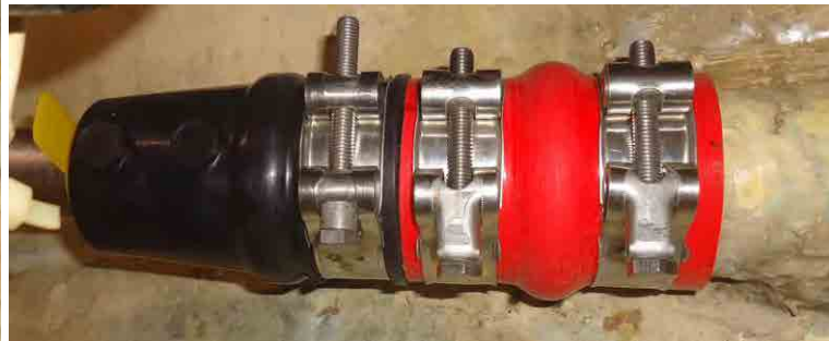
New Stern Gland Fitted