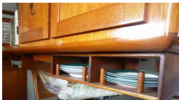
Dish Stowage - New