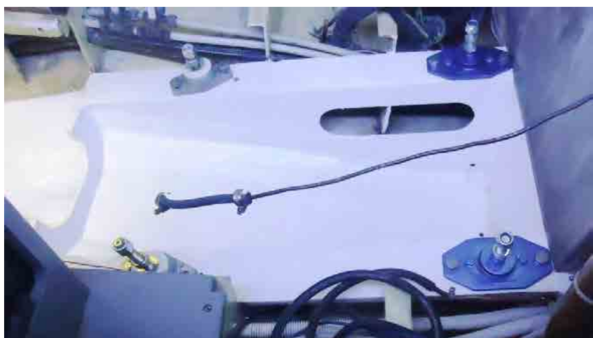
Steering Pedestal rebuilt and new engine mounts