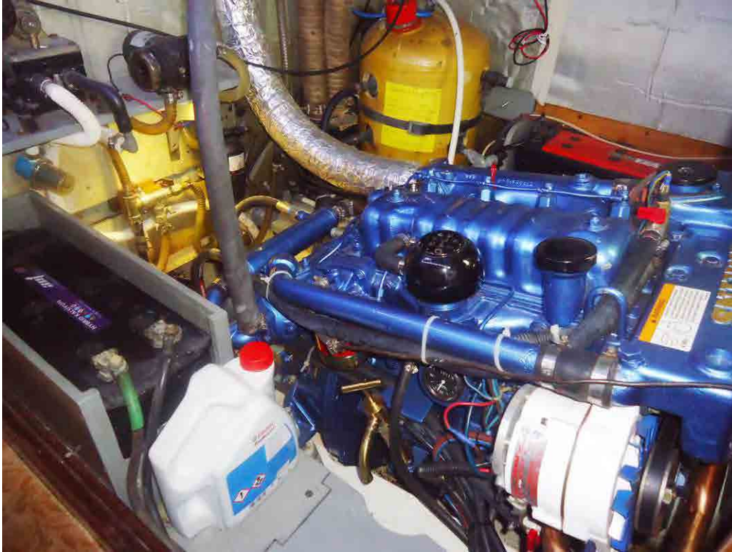
Perkins 4-108 Note: New Balmar 125amp alternator