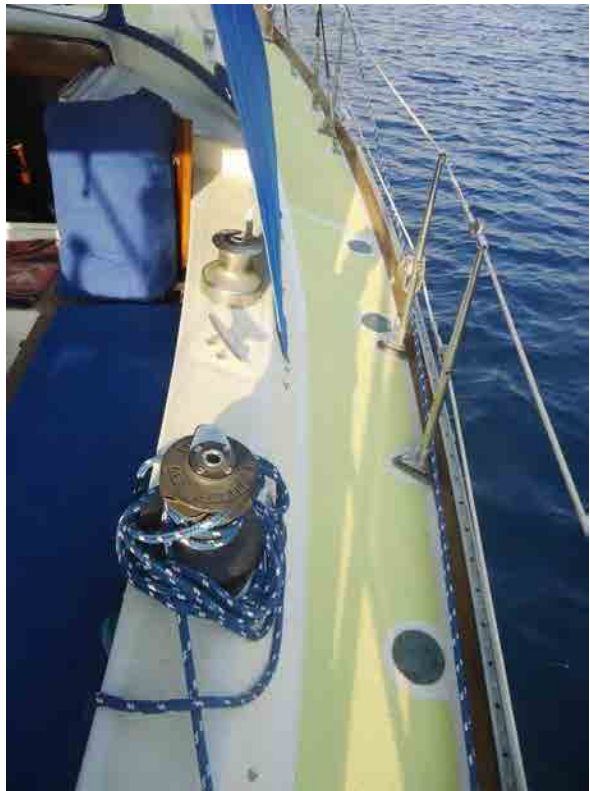
Furling Gear & Stem fitting - Winches and Genoa Track