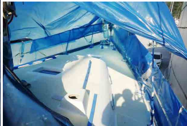
Deck refinishing – Note: deck fittings, hatches etc. removed.