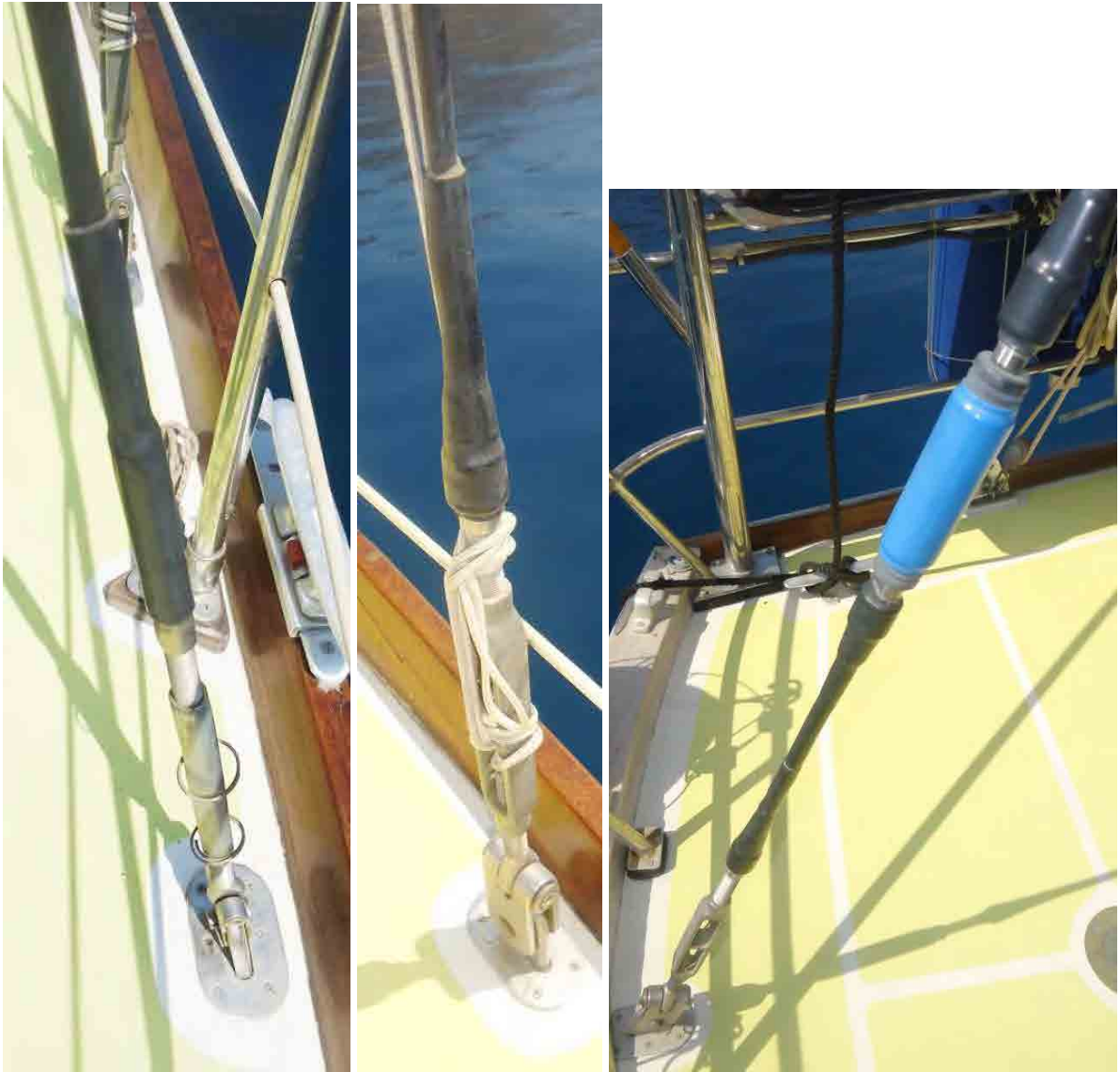
Norselay Rigging Details – Note: fully sealed, rigging insulator & amidships cleat