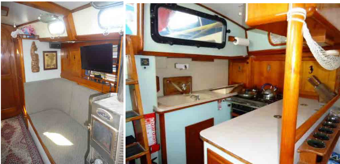
Maincabin to Starboard & Galley