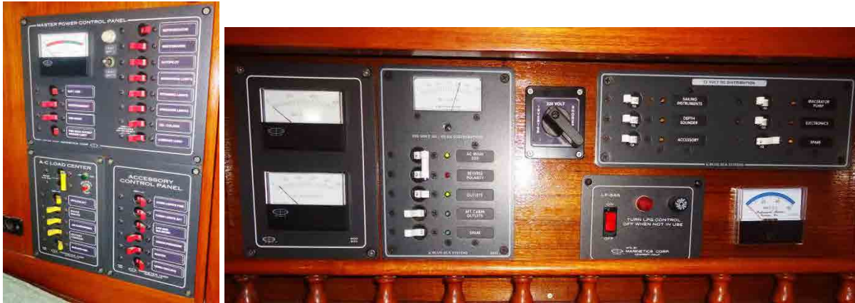
Electrical distribution/Breaker Panels for 12V – 110V & 220V