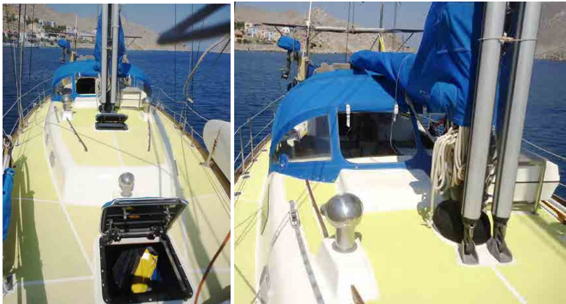
Deck views aft Note:- staysail tracks, cowl vents, hatches, liferaft reaching poles etc..