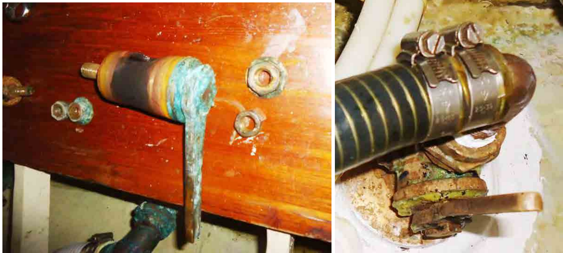
Bronze tapered valve seacock details