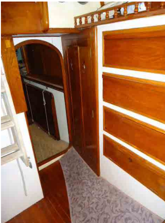
Aftcabin forward to Starboard & Passageway