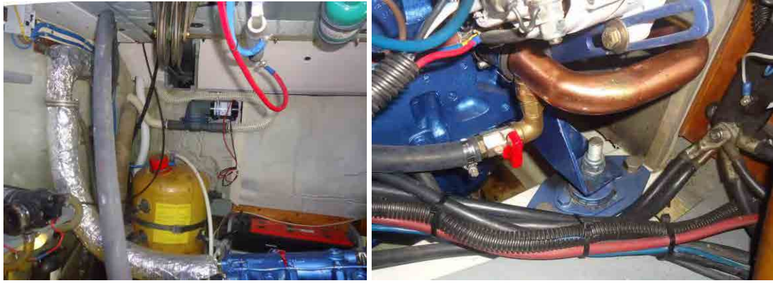
Engineroom to Port - Engine Mount Details