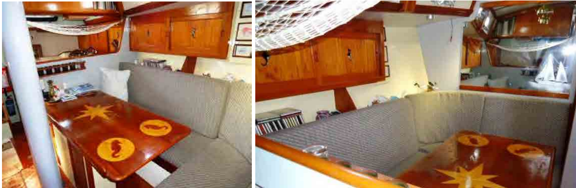
Maincabin to Port