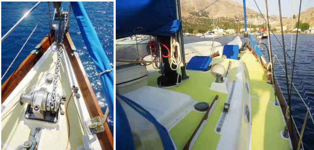
Foredeck detail Note: anchor windlass etc. – Deck View Forward