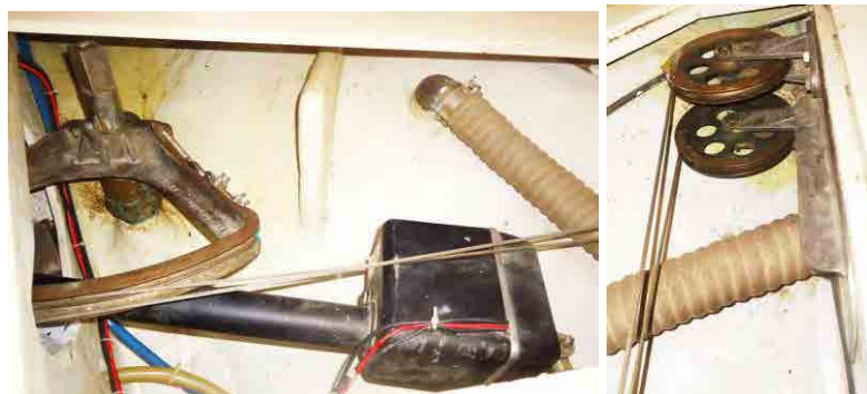
Steering quadrant – Autopilot linear drive – steering sheaves & cables