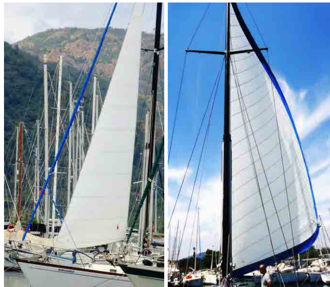
New Staysail & Yankee