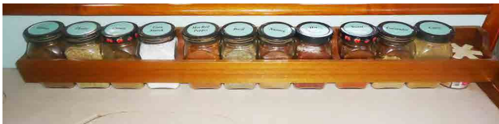
Spice Rack – New