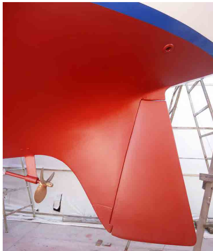
Sterngear – Skeg & Rudder