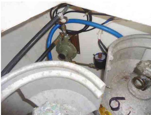
Vented Gas Locker & regulator and remote shut-off valve